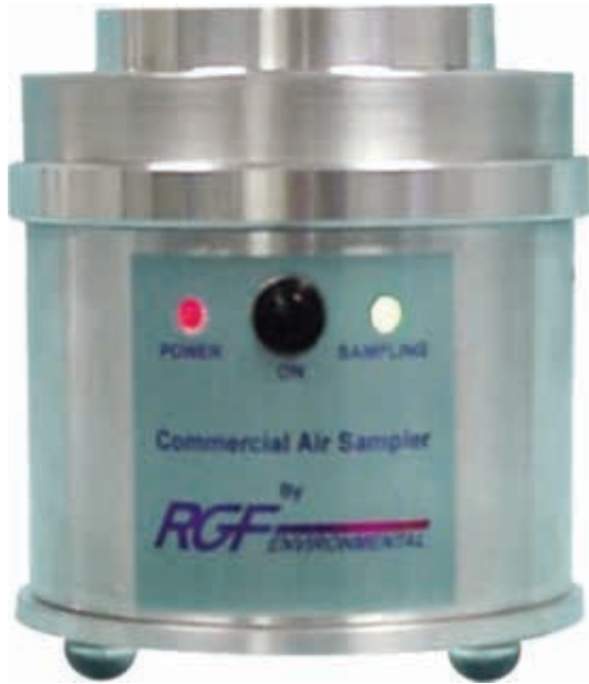
Order # SE500T-z