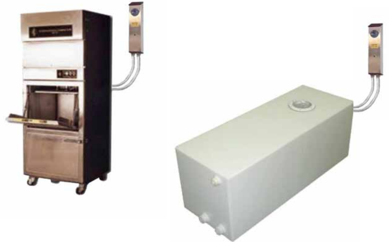
Compactor / Holding Tank Odor and Airborne Bacteria control