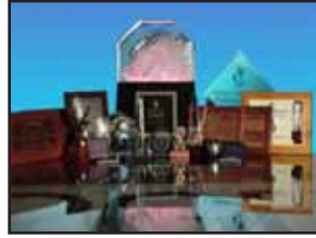
Customer Service Award.